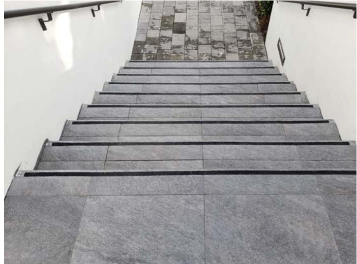
Form-A-Tread dramatically reduces the need for maintenance and replacement even in heavily traveled areas.

In the case of Bear Lakes Country Club, Ramos applied the Form-A-Tread epoxy paste to improve safety and minimize