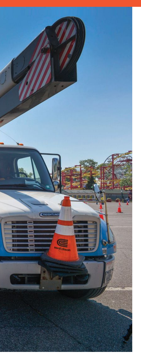
The utility industry has become known as a sector that promotes a collaborative culture, especially when solving problems that impact worker safety.