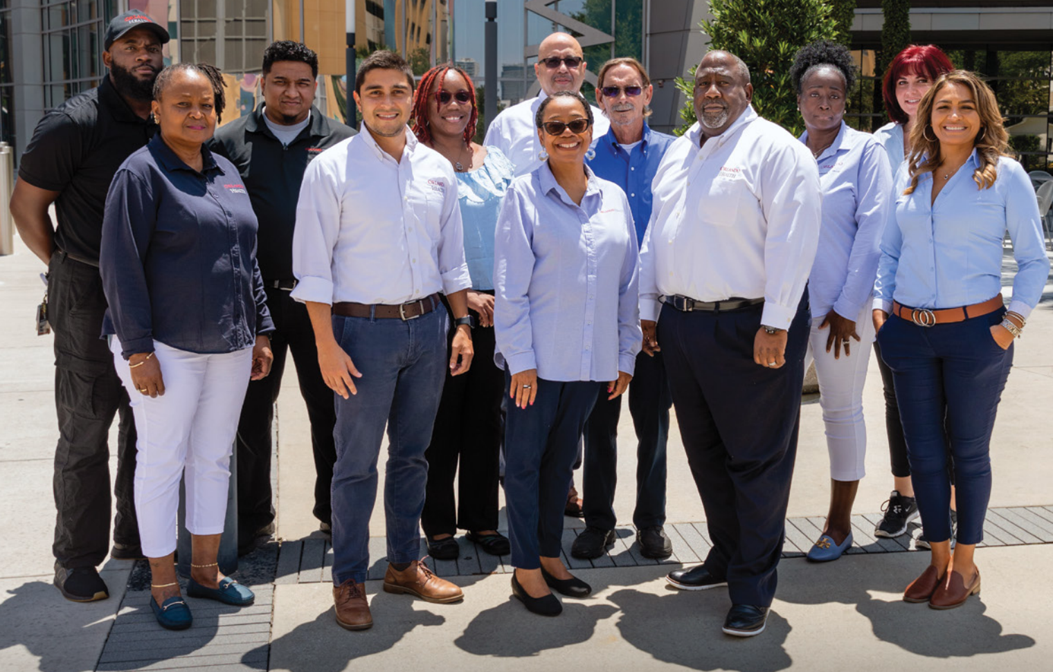
The EVS leadership at Orlando Regional Medical Center, recipient in the 500-plus bed category.