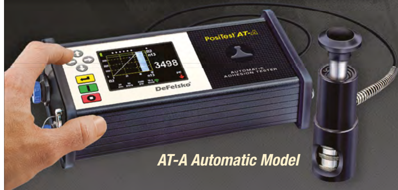
AT-A Automatic Model

Measures adhesion of coatings to metal, wood, concrete, and other rigid substrates