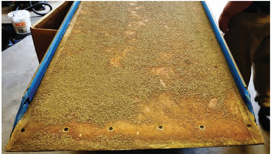
▲ The new coating is designed to last for years even in high use, harsh weather environments, which reduces the need for maintenance and replacement. Ramp shown before Form-a-Tread SL application.

“When they resurfaced the ramp in our lobby, there was essentially no odor, and it was ready for use much faster (than the previous coating they were using),” he says.