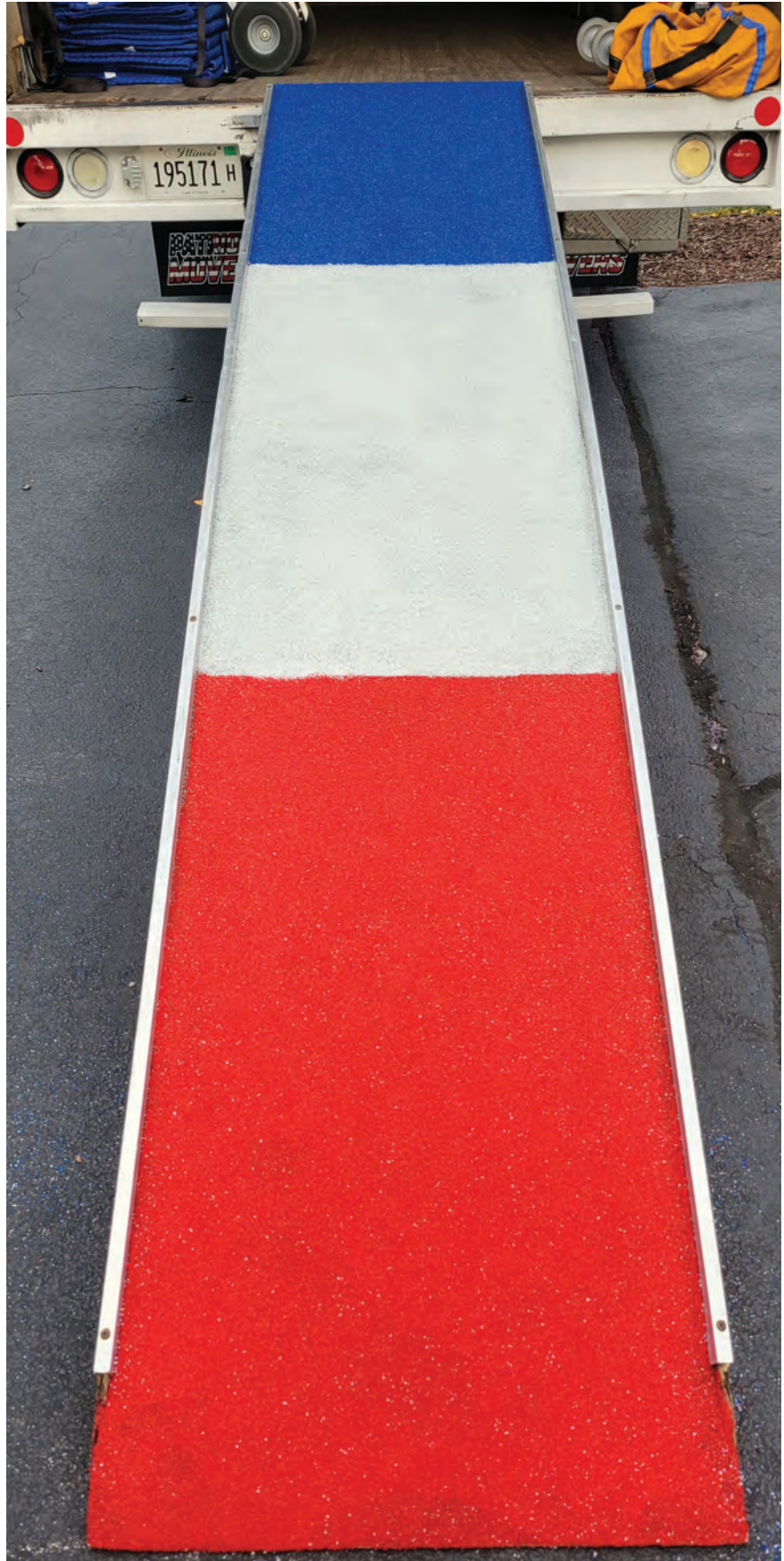
◆ A new category of durable, high-tech, all-epoxy coating dramatically increases traction and improves safety on truck ramps.

Del Williams is a technical writer based in Torrance, California. Find out more, visit www.form-a-tread.com .