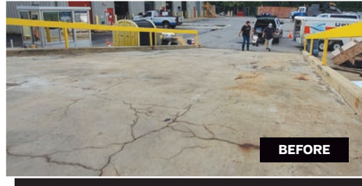
BEFORE: Slippery Ramp Surface Unsightly • Tripping Hazard